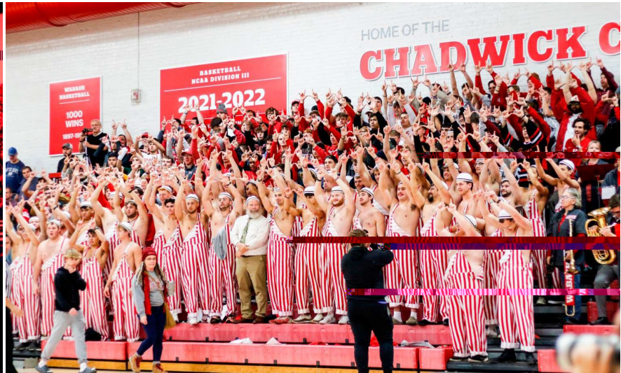
Wabash vs DePauw Basketball 12/29/23