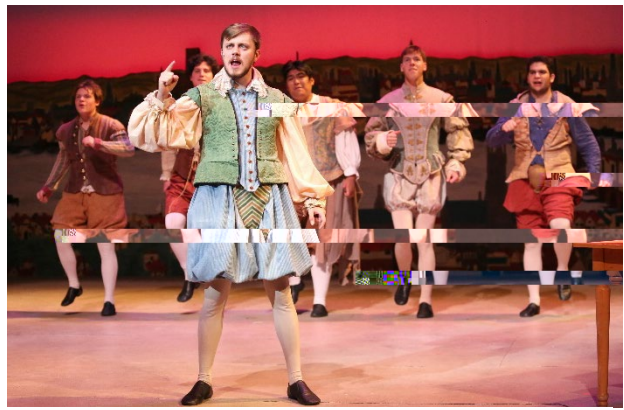
Fall Theater Production: Something Rotten!