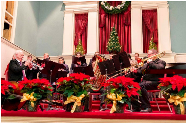
The 55th Annual Christmas Music and Reading Festival