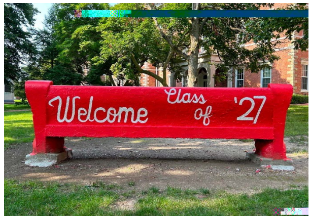
The Senior Bench welcomes the newest class of students