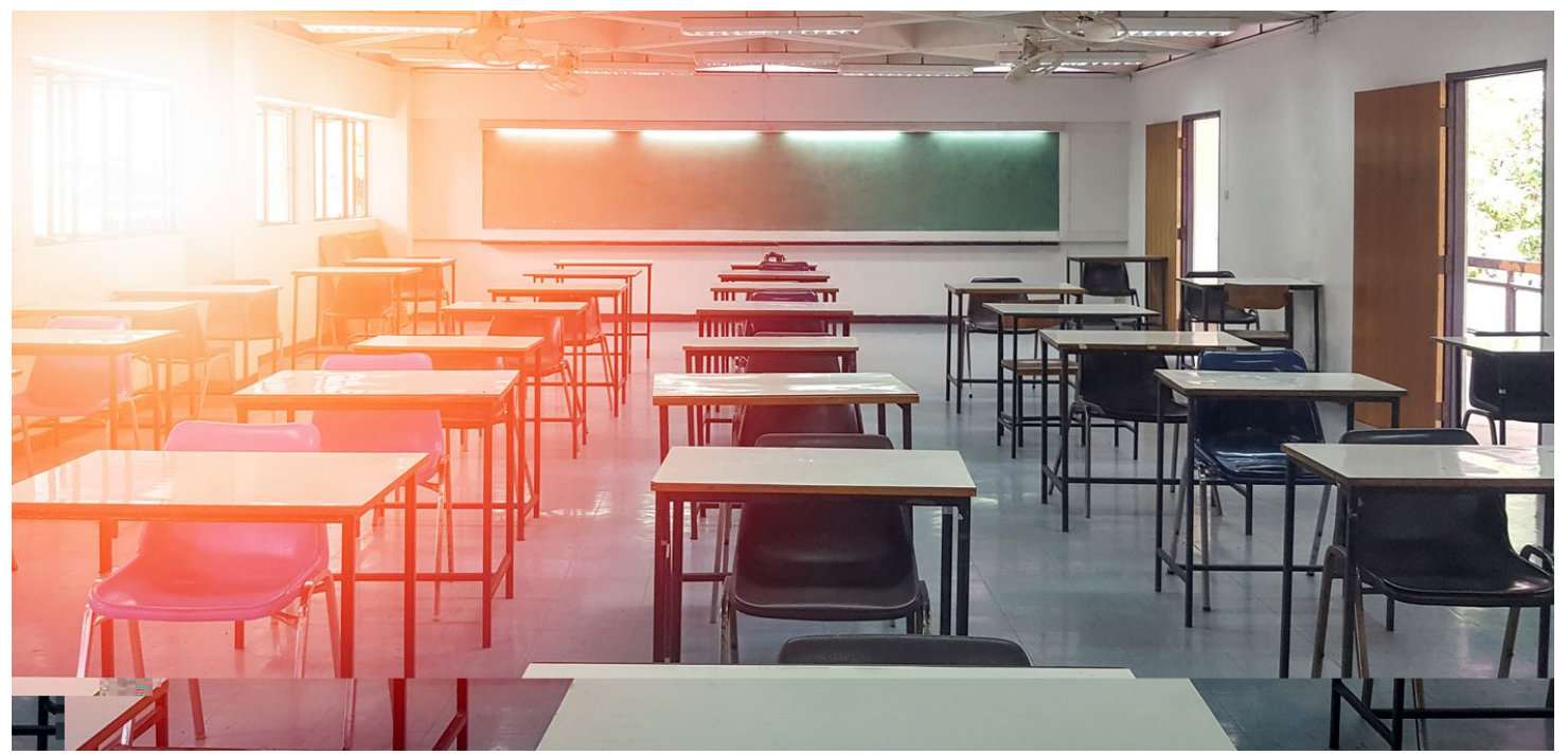
In many cases, student loans are the single enabling factor that provides access to a quality higher education.

For many students, having skin in the game is the right decision